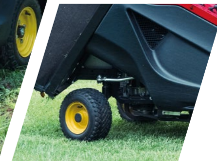
GTM – Front wheel steering GTR – Rear wheel steering