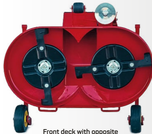
Front deck with opposite rotation blades

The front cutting deck maximises visibility and work control. The grass is not trampled therefore cut quality is increased. The extreme manoeuvrability makes it possible to reach the areas that are less accessible for common front decks, making finishing operations around trees, flower beds and walls easier. The deck is equipped with two retractable blades that absorb collisions and safeguard the transmission from any impact with foreign objects present on the lawn. Installed on a cart with full rubber anti-puncture wheels , the cutting deck floats and naturally adapts to the terrain, resulting in a cut that is always accurate.